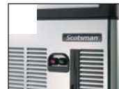
Front ON-OFF Switch Storage bin antibacterial pouch & holder