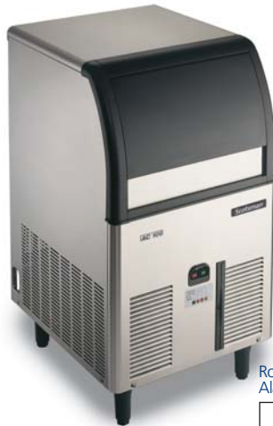
Routine Maintenance Alarm