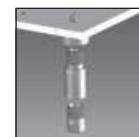
Available as optional KITLGSEXT000