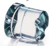
Ø 38 x H 41 mm

This product qualifies for the following listings: