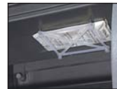
Patented anti-Scale system