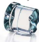
Ø 29 x H 34 mm