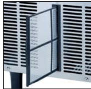
Proximity condenser air filter