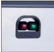
Front ON-OFF Switch