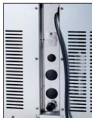
Recessed Connections Panel