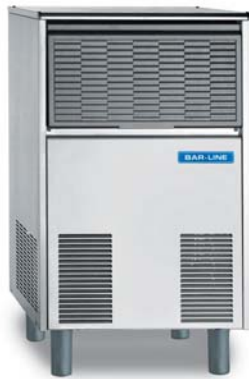
B 50 AS/WS