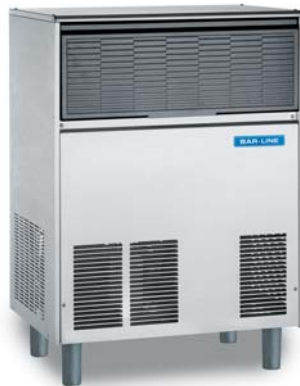
B 65 AS/WS