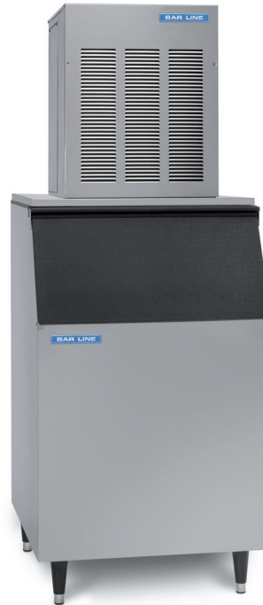
BFM 800 AS/WS on BIN 55

Bar-Line Equipment range is the well-known EU-made line of ice machines used and appreciated by many for its reliability. Built in the Italian manufacturing plant of Frimont Spa, ISO 9001 Certified, these units are built with sturdy, corrosion resistant stainless steel, and feature European-made components to assure maximum ice-quality and machine longevity. Quality tested one-by-one, the Bar-Line self-contained units feature a well balanced ratio between production and storage capacity, alongside with reduced outer dimensions that allow for built-in installations. Contemporary, elegant design unites excellent operational features with the reliability obtained through years of successful experience in ice making technology.