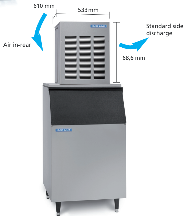
BFM 800 AS/WS on BIN 55