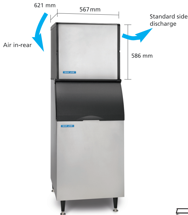
BM 325 AS on BIN 42