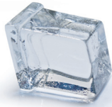
BM 325 AS on BIN 42