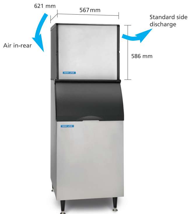
BM 525 AS on BIN 42