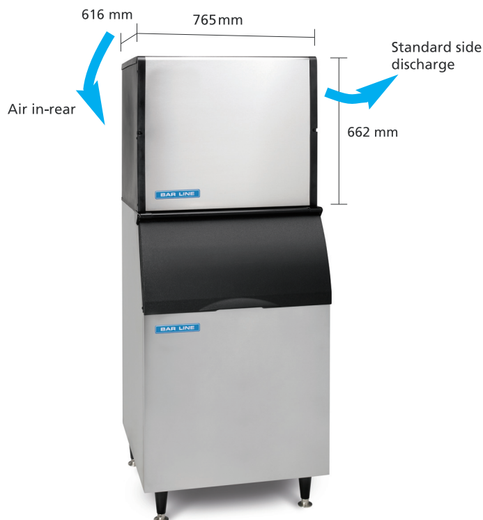
BM 805 AS on BIN 550