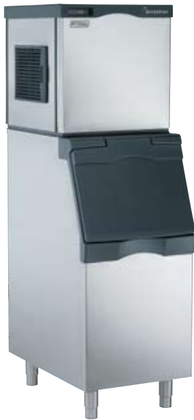
Shown on B322S bin.