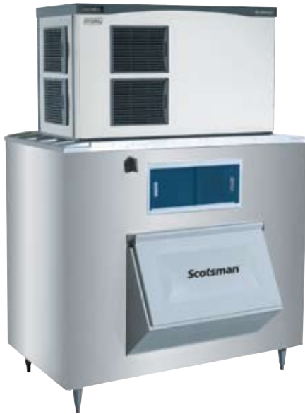
Shown on BH1600SS bin.