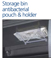
Storage bin antibacterial pouch & holder