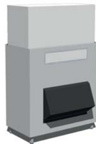
MC1210 with UBH1600 (sold separately)