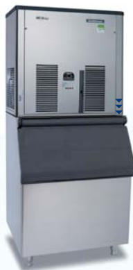
MC 16 "SHORT" with SB 393 (sold separately)