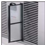
Proximity condenser air filter (AS version only)