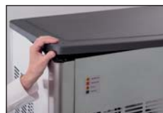
ABS plastic cover