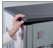
ABS plastic top cover