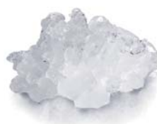
Residual water contents 25%

Ice in its most natural form, made at a temperature just below zero degrees Celsius, contains 25% residual water content, making it very moist. Its flake shape makes it extremely versatile and very simple to use effectively.