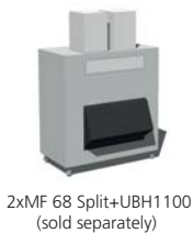
2xMF 68 Split+UBH1100 (sold separately)