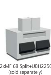
2xMF 68 Split+UBH2250 (sold separately)