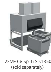
2xMF 68 Split+SIS1350 (sold separately)