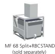
MF 68 Split+RBCSTAND (sold separately)