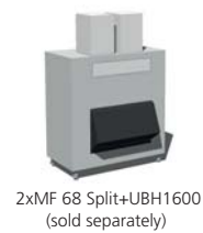
2xMF 68 Split+UBH1600 (sold separately)