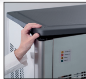
ABS plastic top cover