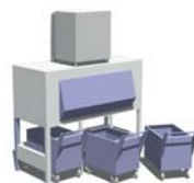
MFN 86+ITS2250/ITS3250 (sold separately)