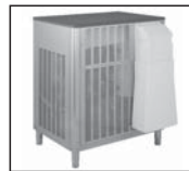
Standard Ice Shut included