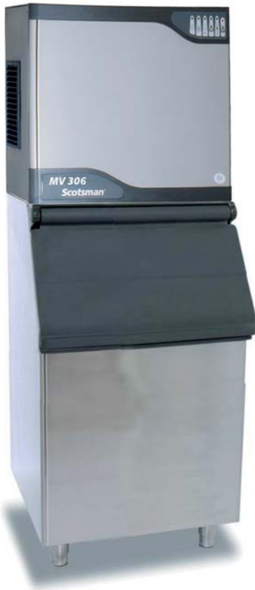
MV 306 with SB322 (sold separately)