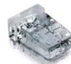
Small Cube - 6 g W 11 x D 23 x H 26 mm