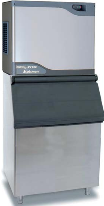
P-MV 606 with SB530 (sold separately)